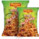
Peawal BBQ Chanachur-140g, 200g