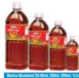
Marine Mustard Oil-300ml, 250ml, 500ml, 1L