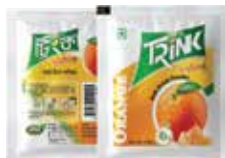
Trink Soft Drink Powder (Orange) 7g