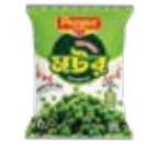
Peawal Peanut Pear-12g