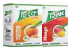
Trink Soft Drink Powder Box