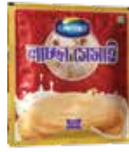
I Rich Lachcha Shemal-180g