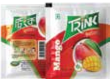
Trink Soft Drink Powder (Mango) 7g