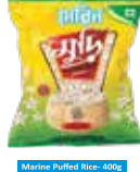
Marine Puffed Rice- 400g