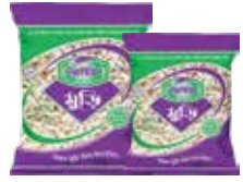
I Rich Puffed Rice-250g, 500g