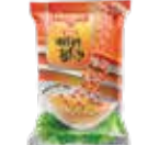
Peawal Jhal Momi-25g