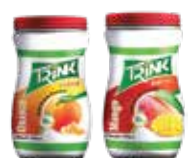
Trink Soft Drink Powder Jar-250g